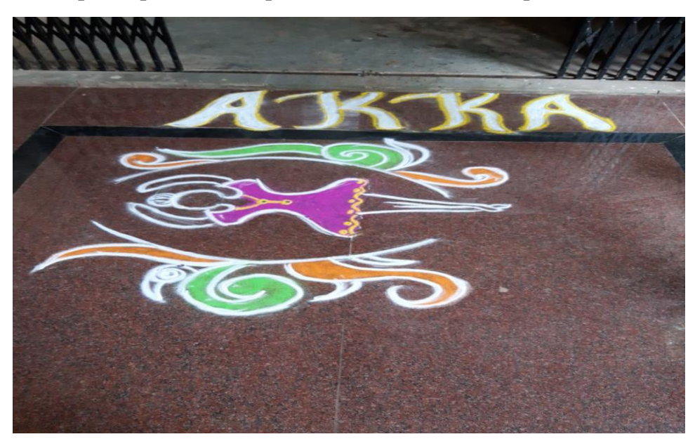
Let the Rangoli Tell its Ancient Tale

• Free hand rangoli computation was conducted for girl's students. Number of students participated in computation. First and second prises were distributed.