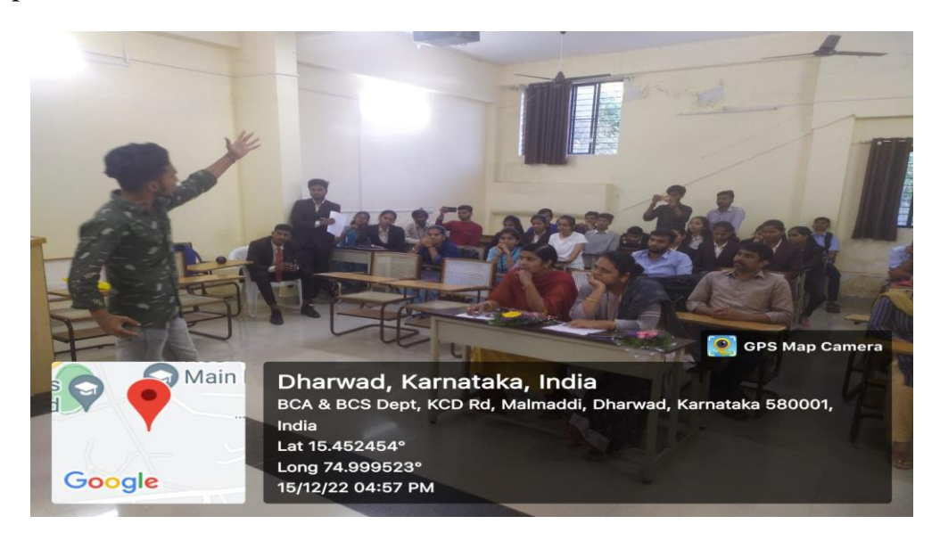
Opponents at debate with audience

A debate computation was organised for both girls and boys students on 15-12-2022 and the topic was "Is women's empowerment a myth?". Many students were participated in the event.